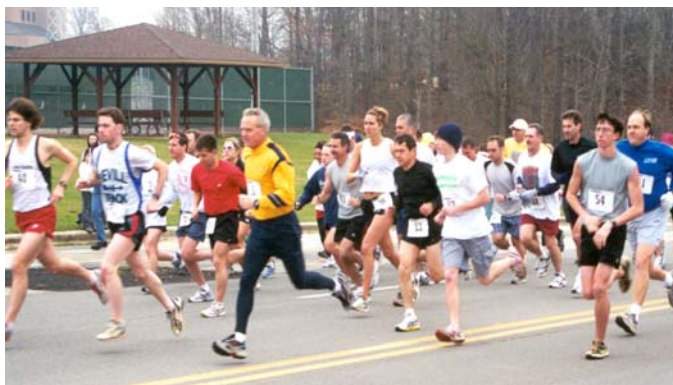
Start of the 10K Race

Complete race results at www.wallacestate.edu